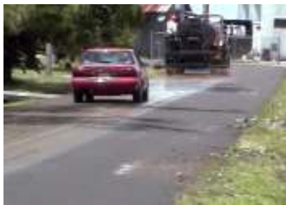
Minimal traffic interruption. All treated areas open at day's end.