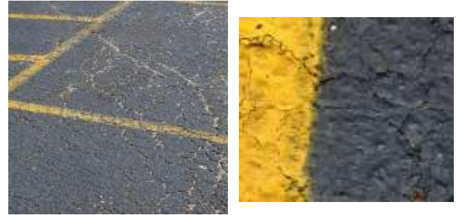
Seal coats make asphalt dry and brittle. Maintenance costs are increased and surface life is shortened.