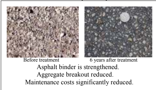
Before treatment 6 years after treatment Asphalt binder is strengthened. Aggregate breakout reduced. Maintenance costs significantly reduced.