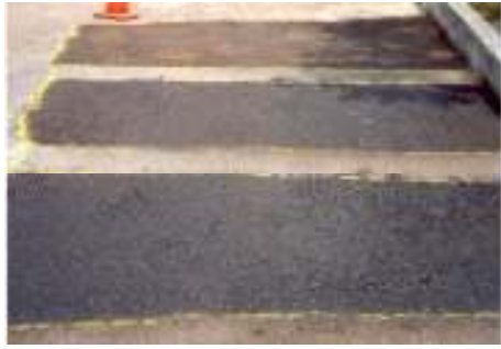
Penetrates in three applications! Surface life is extended.