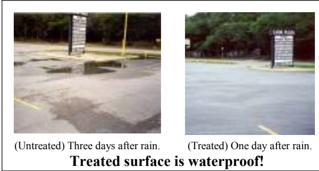
(Untreated) Three days after rain. (Treated) One day after rain.