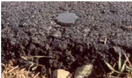
Most surfaces look & wear like new overlay.