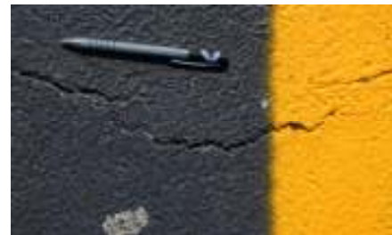
Surface cracks are not sealed. Traffic will quickly wear off this "paint".