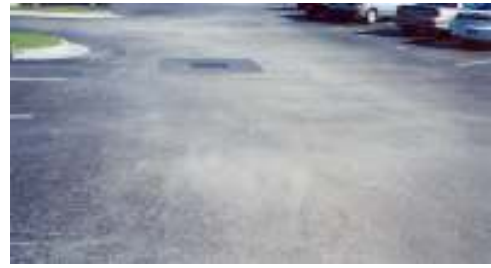
Seal coat worn off after 9 months.