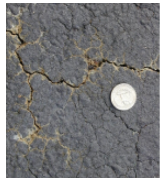
Spider cracks form rapidly in all seal coated surfaces.